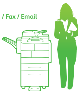
WorkCentre 4260XF with finisher and 2,000-sheet high-capacity feeder